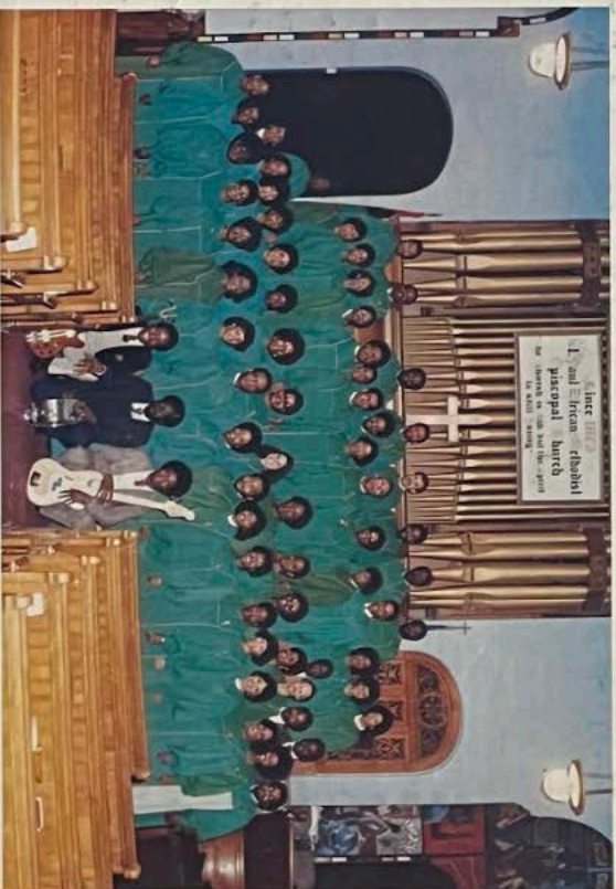
The New Temple Singers of St. Paul A.M.E. Church, Cambridge, MA